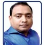
Rahul Shee Pest Control