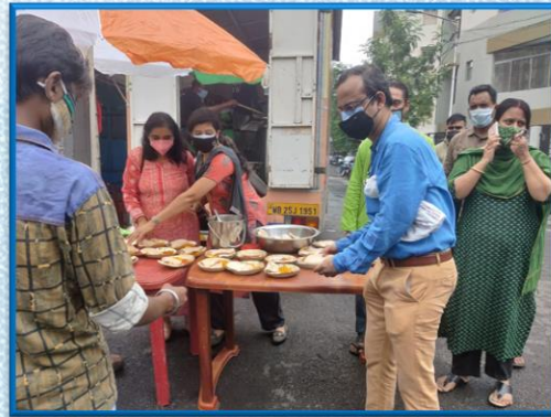
Project AAHAR - in association with Apni Roti. Food distribution at Dhakuria