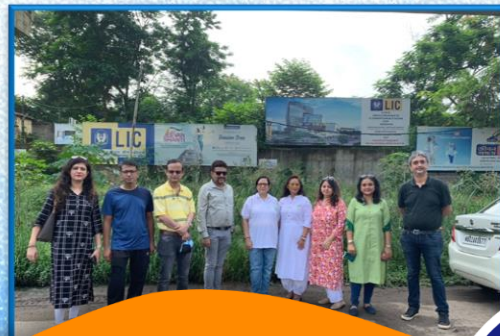
Time for some Fun Adda over tea and snacks