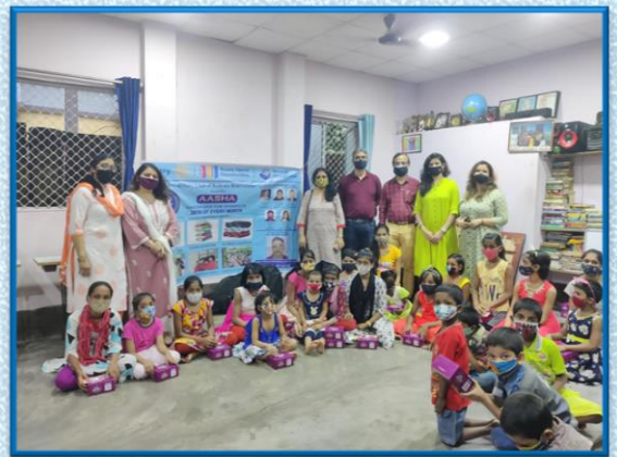
Project AASHA - Distributed Food, Medicines and Gifts at Arunima Hospice a shelter home for children