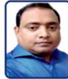
Rahul Shee Pest Control